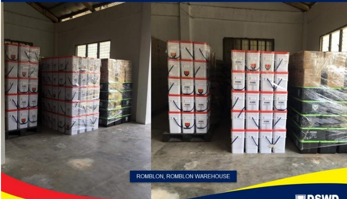
ROMBLON, ROMBLON WAREHOUSE

DSWD Field Office MIMAROPA facilitates the prepositioning of food and non-food items in preparation for the possible effects of Tropical Depression Rosal in the Region.