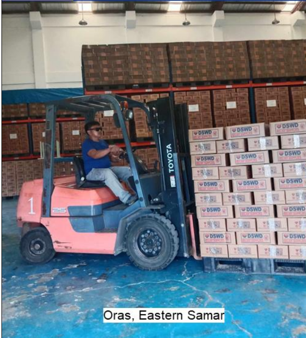
Oras, Eastern Samar

DSWD Field Office VIII facilitates the loading of family food packs for onward distribution to families in Northern Samar and Eastern Samar affected by the effects of Low Pressure Area (LPA) and Shear Line.