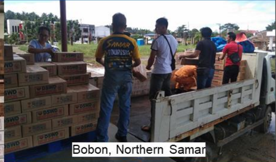
Bobon, Northern Samar