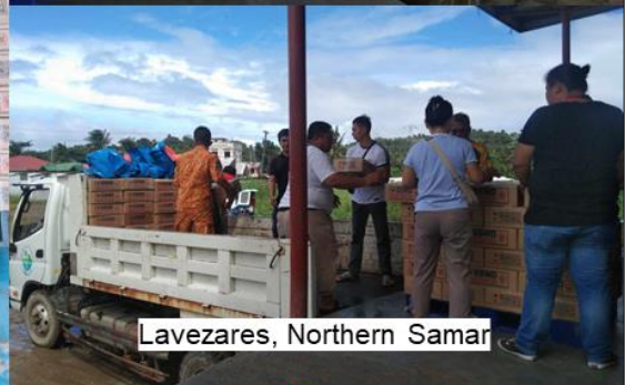
Lavezares, Northern Samar