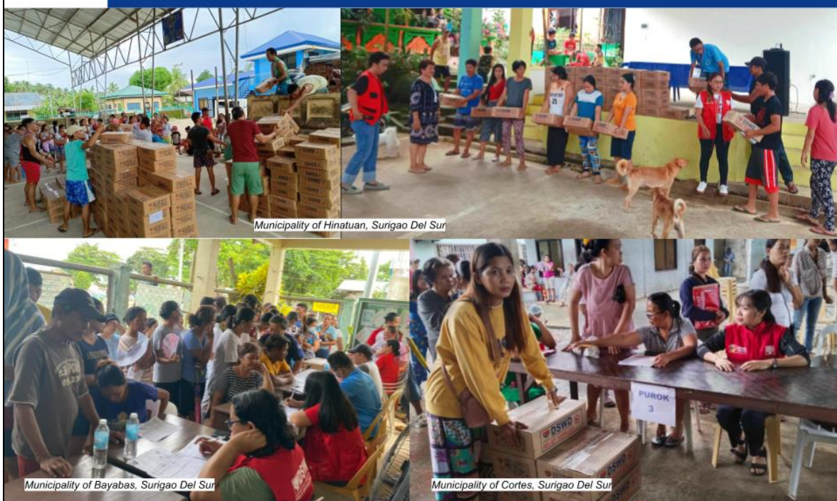
Municipality of Hinatuan, Surigao Del Sur

DSWD Field Office Caraga facilitates the distribution of Family Food Packs (FFPs) as augmentation support to the affected families of the Mw 7.4 Earthquake Incident in the Municipalities of Hinatuan, Bayabas, and Cortes, Surigao Del Sur.