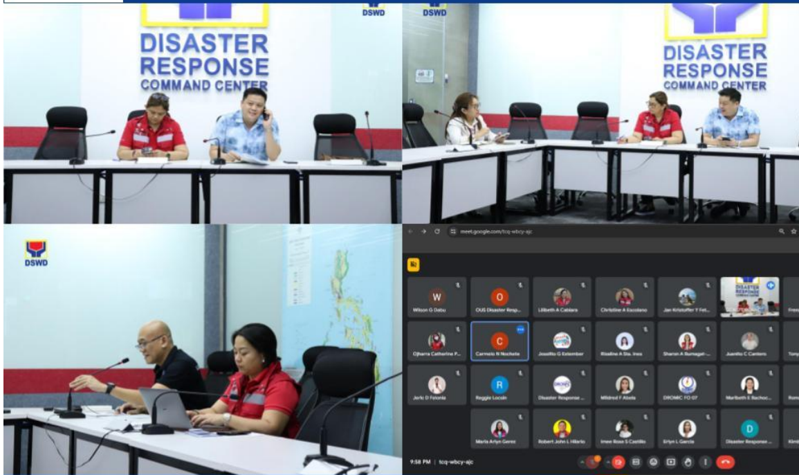
03 JUN 2024 DSWD Secretary Rex Gatchalian dishes out instructions to DSWD Regional Directors from the Visayas Region on how to efficiently respond to those who will be affected by the eruption of Mt. Kanlaon in Negros Island.