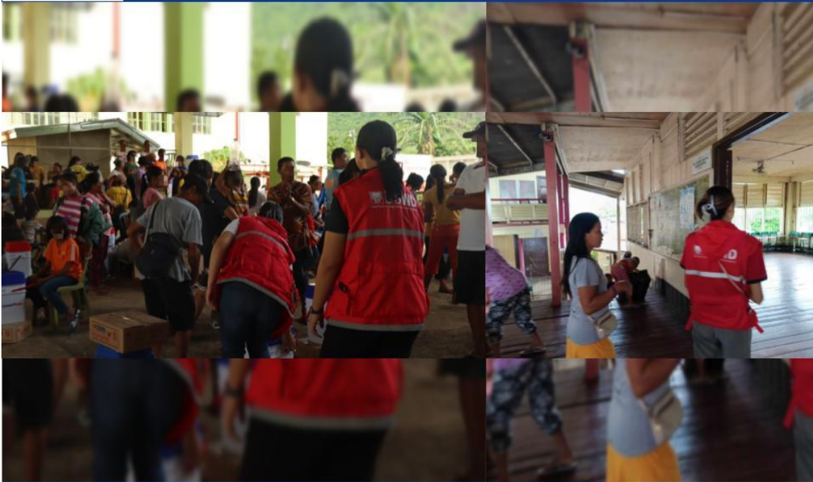
20-21 JUN 2024 DSWD FO VI conducts inspection at La Castellana Elementary School, Don Felix Robles Elementary School and St. Vincent High School before the decampment of Internally Displaced Persons (IDPs).