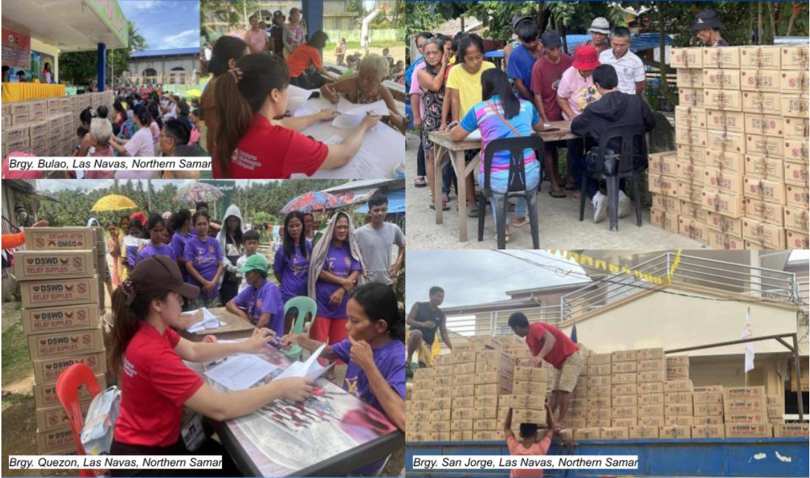
Brgy. Bulao, Las Navas, Northern Samar