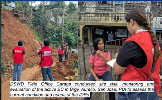
DSWD Field Office Caraga conducted site visit, monitoring and evaluation of the active EC in Brgy. Aurelio, San Jose, PDI to assess the current condition and needs of the IDPs.