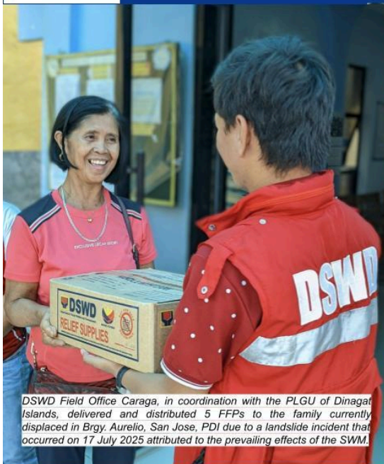
DSWD Field Office Caraga, in coordination with the PLGU of Dinagat Islands, delivered and distributed 5 FFPs to the family currently displaced in Brgy. Aurelio, San Jose, PDI due to a landslide incident that occurred on 17 July 2025 attributed to the prevailing effects of the SWM.

The DSWD Field Office Caraga in coordination with local government units provided aid to disaster-affected communities in Surigao Del Norte and Dinagat Islands.